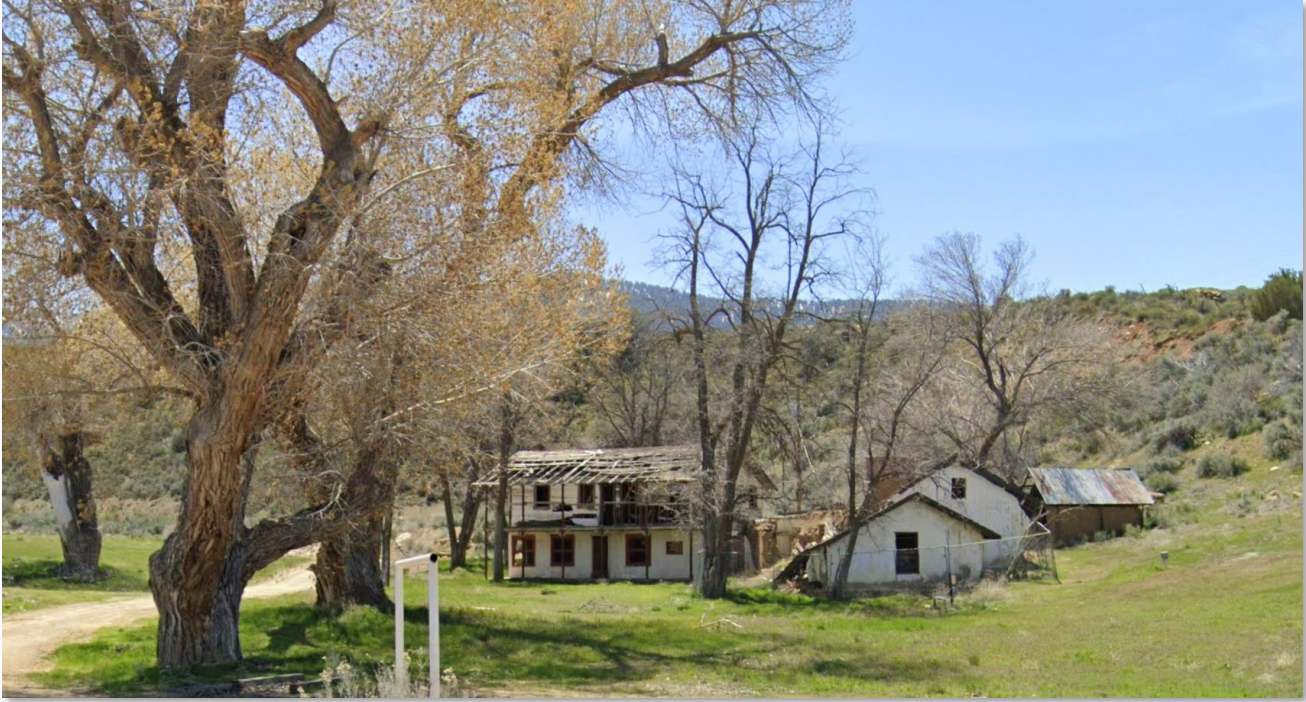
Figure 2 – Street View of Rafael Reyes Adobe