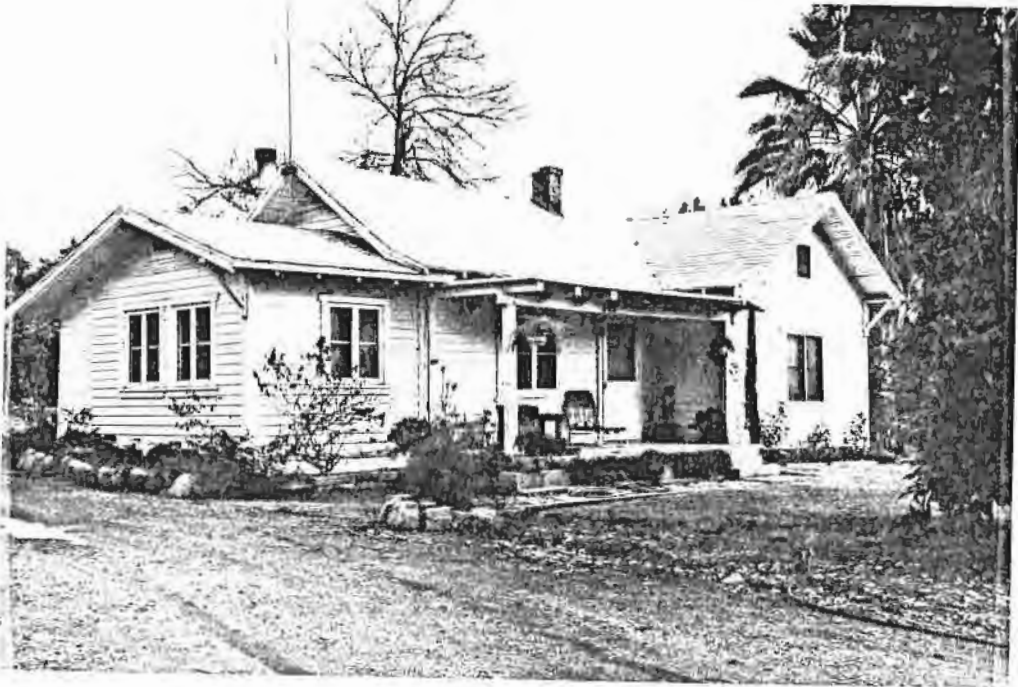
282 Mc Nell Road