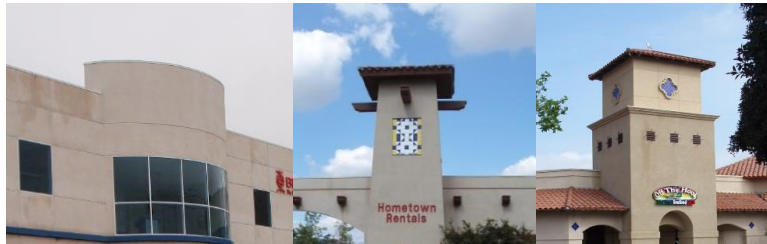
Examples of Building-Concealed Wireless Communication Facilities (ADD. ORD. 4470 – 3/24/15)

Wireless Communication Facility, Building-Concealed—: A wireless communication facility designed and constructed as an architectural feature of an existing building in a manner where the wireless communication facility is not discernible from the remainder of the building . Standard building architectural features used to conceal a wireless communication facility include, but are not limited to, parapet walls, windows, cupolas, clock towers, and steeples. (See Section 8107-45. )