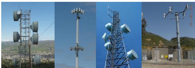
Examples of Non-Stealth Wireless Communication Facilities (ADD. ORD. 4470 – 3/24/15)

Wireless Communication Facility, Non-Stealth -: A wireless communication facility that is not disguised or concealed and does not meet the definition of a stealth facility or building-concealed facility. (See Section 8107-45.)