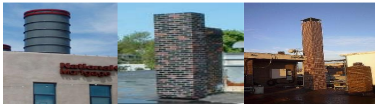
Examples of Roof-Mounted Wireless Communication Facilities (ADD. ORD. 4470 – 3/24/15)

Wireless Communication Facility, Roof-Mounted —: A wireless communication facility that is mounted directly on the roof of a building . (See Section 8107-45. )