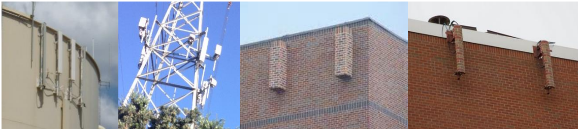
Examples of Flush Mounted Wireless Communication Facilities (ADD. ORD. 4470 – 3/24/15)

Wireless Communication Facility, Flush-Mounted : A wireless communication facility with an antenna attached directly to the exterior of a structure or building and that remains close and is generally parallel to the exterior surface of the structure or building . Associated equipment for the antenna is not flush-mounted and is located inside an existing building , on a rooftop, at the ground level, or underground. (See Section 8107-45.)