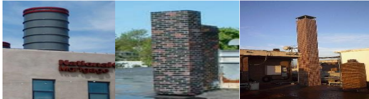
Examples of Roof-Mounted Wireless Communication Facilities (ADD. ORD. 4470 – 3/24/15)

Wireless Communication Facility, Roof-Mounted : A wireless communication facility that is mounted directly on the roof of a building . (See Section 8107-45.)