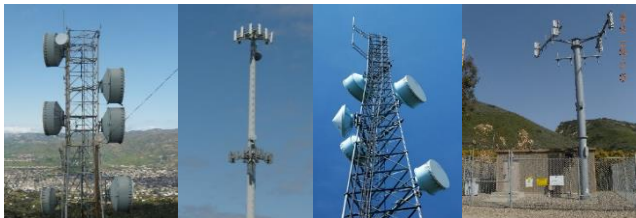
Examples of Non-Stealth Wireless Communication Facilities (ADD. ORD. 4470 – 3/24/15)

Wireless Communication Facility, Non-Stealth : A wireless communication facility that is not disguised or concealed and does not meet the definition of a stealth facility or building-concealed facility . (See Section 8107-45.)