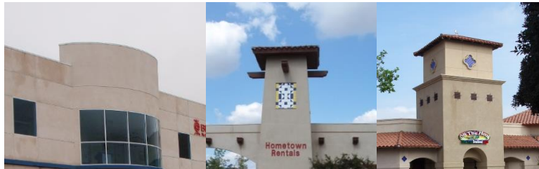
Examples of Building-Concealed Wireless Communication Facilities (ADD. ORD. 4470 – 3/24/15)

Wireless Communication Facility, Building-Concealed : A wireless communication facility designed and constructed as an architectural feature of an existing building in a manner where the wireless communication facility is not discernible from the remainder of the building . Standard building architectural features used to conceal a wireless